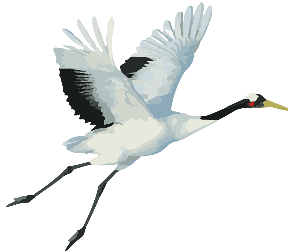
Identity & Intimacy April - Always

The appreciation is wonderful, makes me feel light and warm. BUT how do I fly .. How do I really fly? This is the time for Koonj to go beyond appreciation and connect all the writers, doodlers and more, and develop a team of editors who hold a critical eye and wisdom to help Koonj prepare for its flight. The time for publishers to show their trust and outlets to open their spaces.