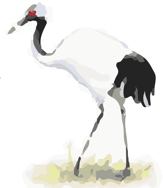
Generativity & Ego Integrity Always - Beyond

I am gradually being unveiled to the world, as I travel to different places. They are getting to know Koonj, the readers wondering, the viewers observing, and bystanders watching. My social media team will introduce me amongst the norms of today, boosting my appearance on screens that we carry in our pockets.