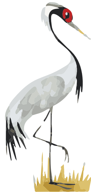
Initiative & Industry March - July