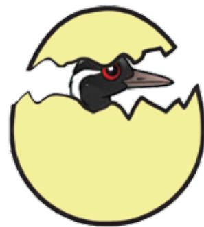
Trust & Autonomy March - May